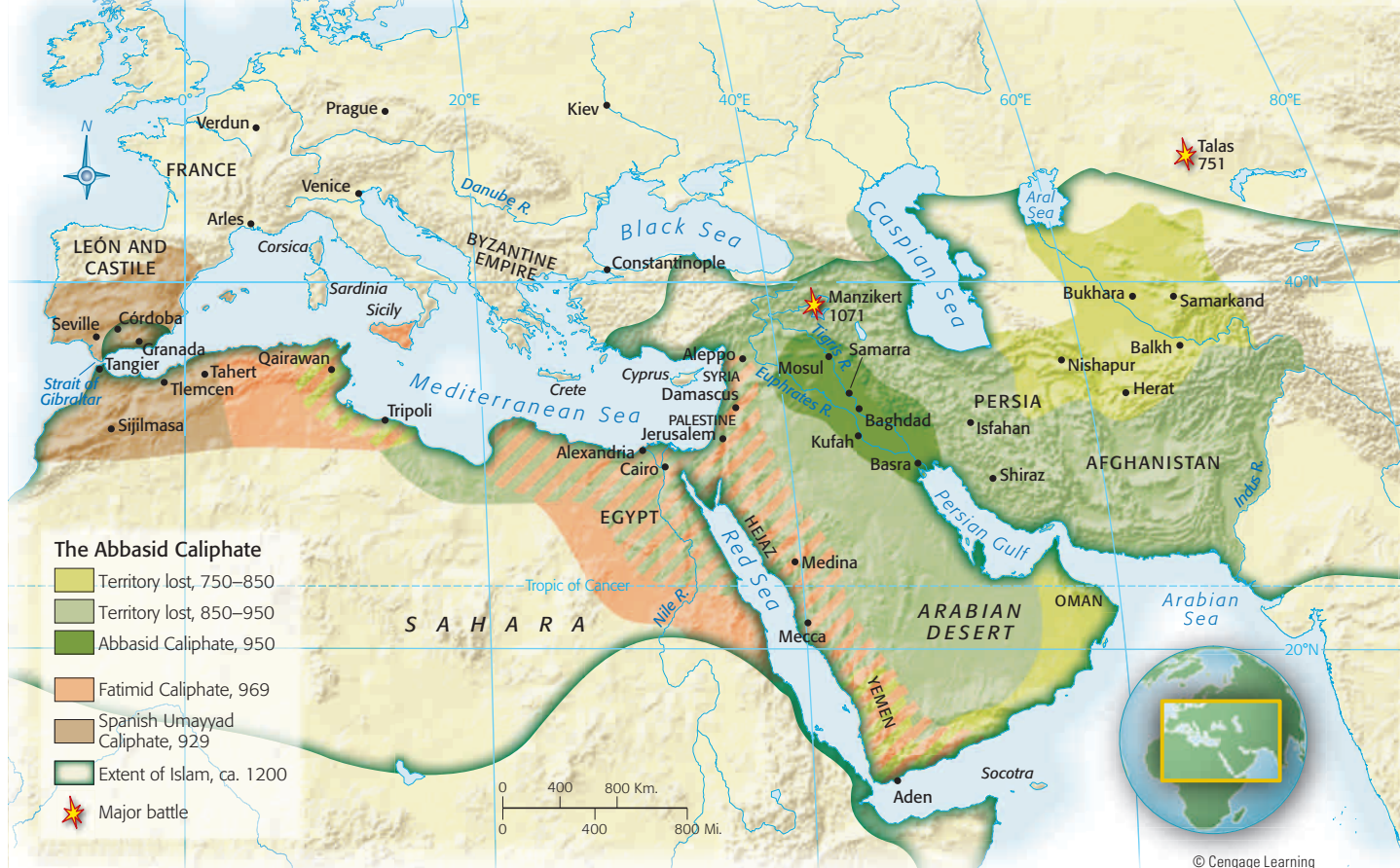
MAP 8.2 Rise and Fall of the Abbasid Caliphate Though Abbasid rulers occupied the caliphal seat in Iraq from 750 to 1258, when Mongol armies destroyed Baghdad, real political power waned sharply and steadily after 850. The rival caliphates of the Fatimids (909–1171) and Spanish Umayyads (929–976) were comparatively short-lived.